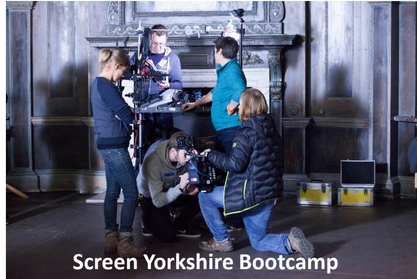
Screen Yorkshire Bootcamp