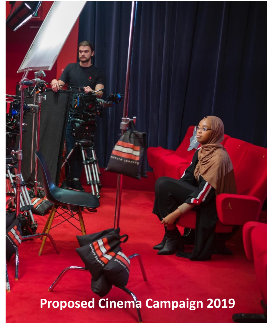
Proposed Cinema Campaign 2019